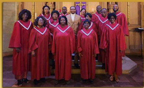
Wesley United Methodist Church (Worcester MA)