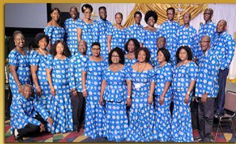
St. Isaac Jogues Ghanaian Parish Choir. (East Hartford CT)