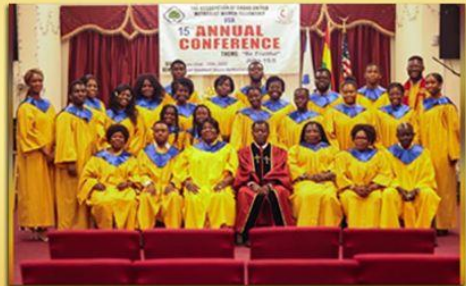
Good Shepherd Methodist Church (Worcester MA)