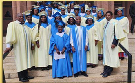
Mount Zion Presbyterian Choir (Worcester MA)